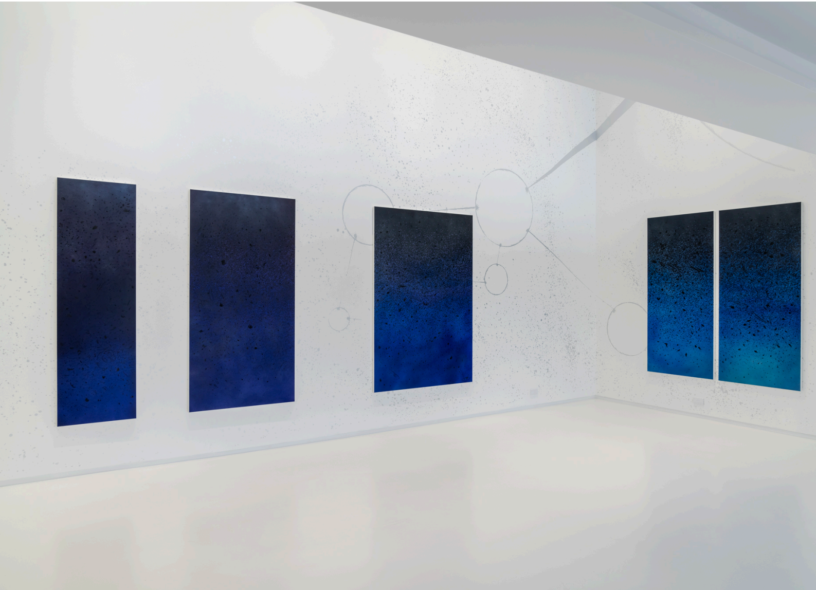
Exhibition views, COLD PITCH , BB&M, Seoul, 2022. Works by Hyangro Yoon.