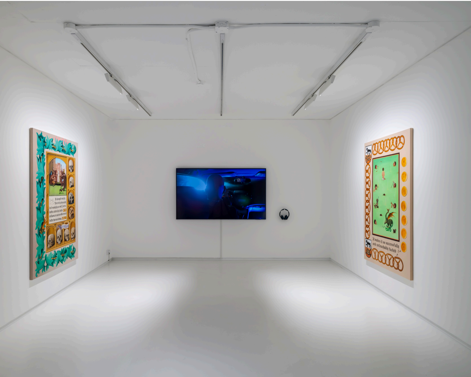
Exhibition views, COLD PITCH , BB&M, Seoul, 2022. Works by Sinae Yoo.