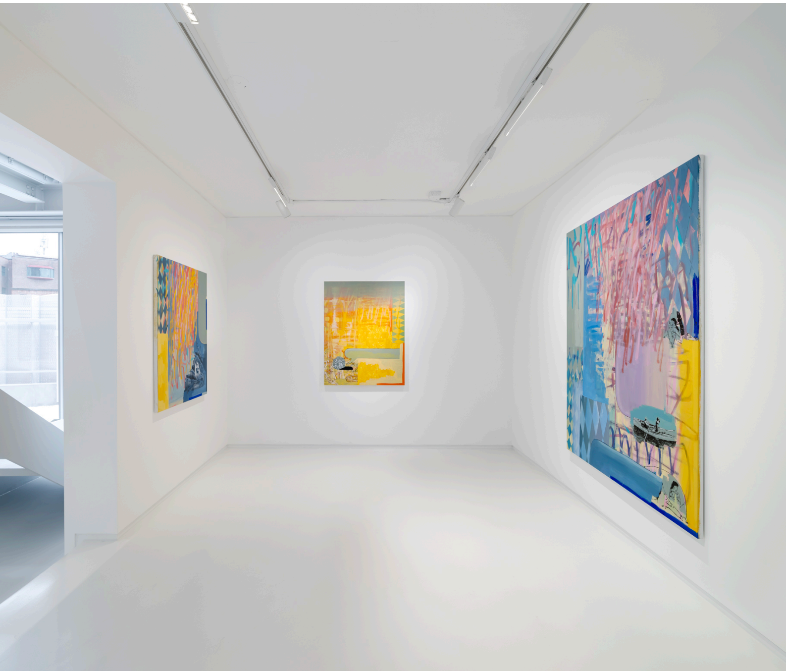
Exhibition views, COLD PITCH , BB&M, Seoul, 2022. Works by Jeongsu Woo.